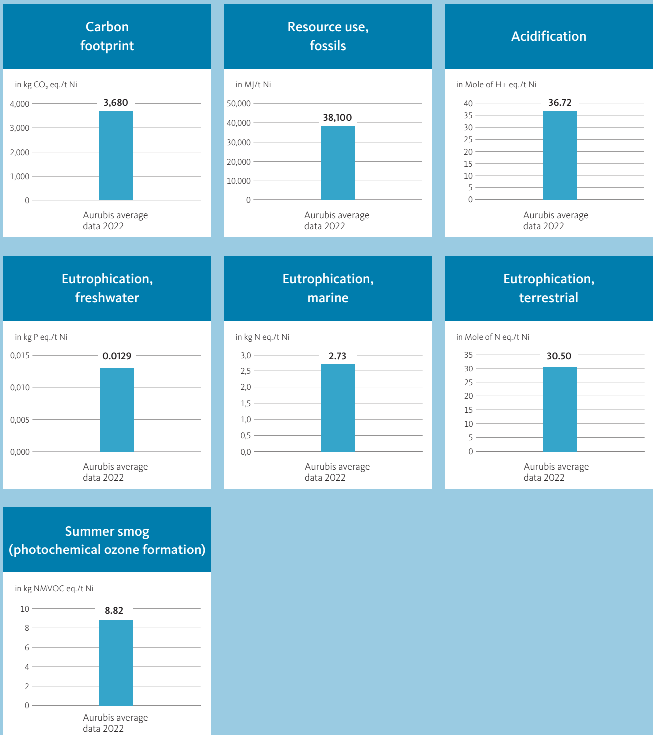
Figure 1: Results for 1 ton of Ni contained in Aurubis NiSO 4 (2022), (Environmental footprint EF 3.0)

The life cycle impact results for the key impact categories for Aurubis Raw Nickel sulphate ( per 1 ton of Ni contained ) for the reference year 2022 are presented below.